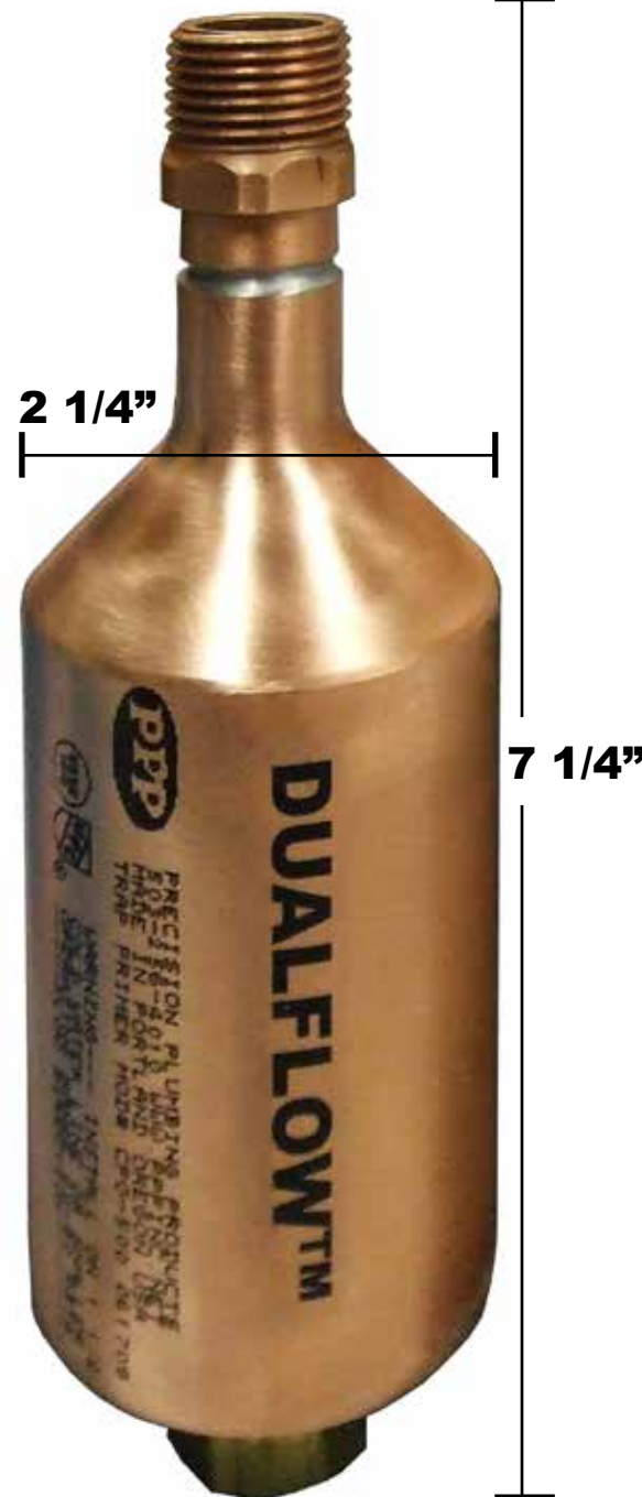
PART NO: CPO-500

Constructed of type K copper body, Sarlink 4145B diaphragm, #60 stainless steel mesh screen.